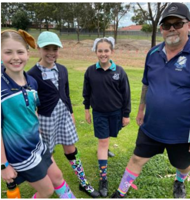
Term 4 Week 7 25.11.22